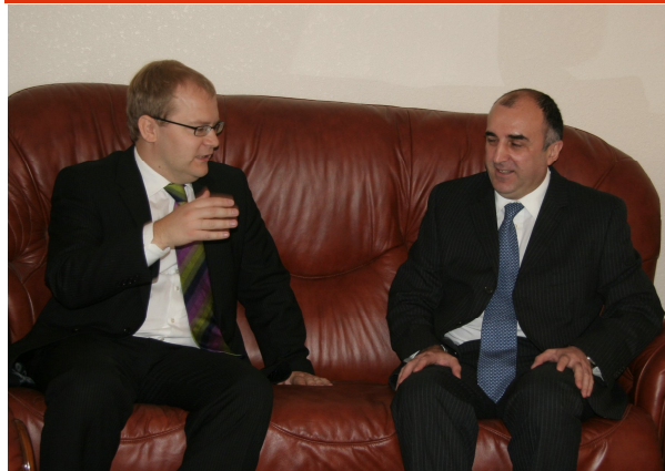
Foreign Minister Urmars Paet and his Azerbaijani colleague Elmar Mammadyarov in Baku, 29 October.